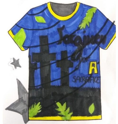
Art work by a Year 6 child who thought about why Jesus died on the cross.

It is a privilege to share the Good News with the children of our town, but it's not easy or straightforward. We value your prayers more than you can know!